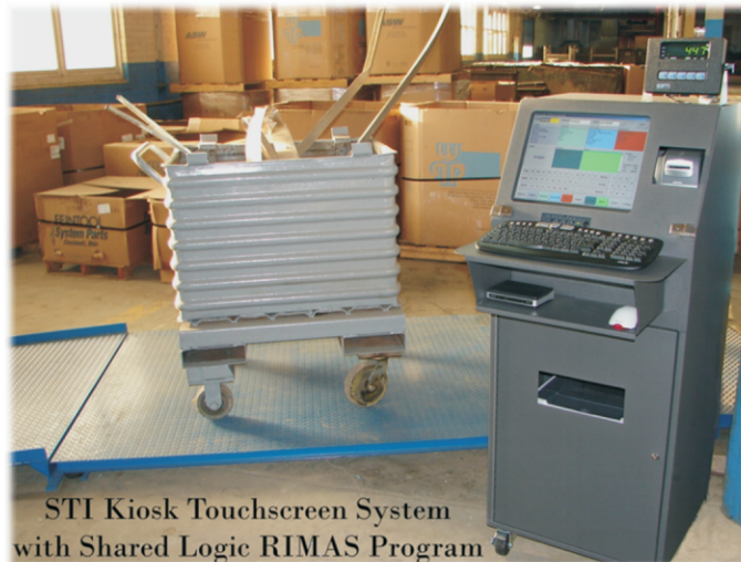
STI Kiosk Touchscreen System with Shared Logic RIMAS Program

For more information Contact ATM Cash Vault, LLC. (888) Scrap-Now (727-2766)